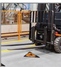
Slip-Gard™ Floor Triangles