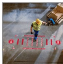
Slip-Gard™ Crosswalk Kits