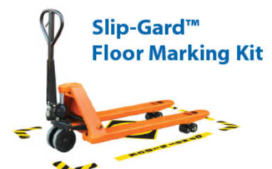
Slip-Gard™ Floor Marking Kit

Contact your SSI Representative for all your Accuform Needs!