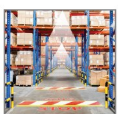
NEW LED Crosswalk Projector